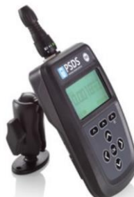
-MUR PSDS Vertical fixing (walls, dashboards...)