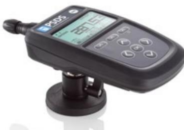
-MAGN PSDS Magnetic holding pad