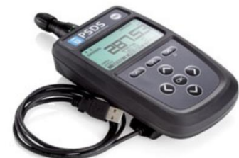
-USB PSDS USB connector